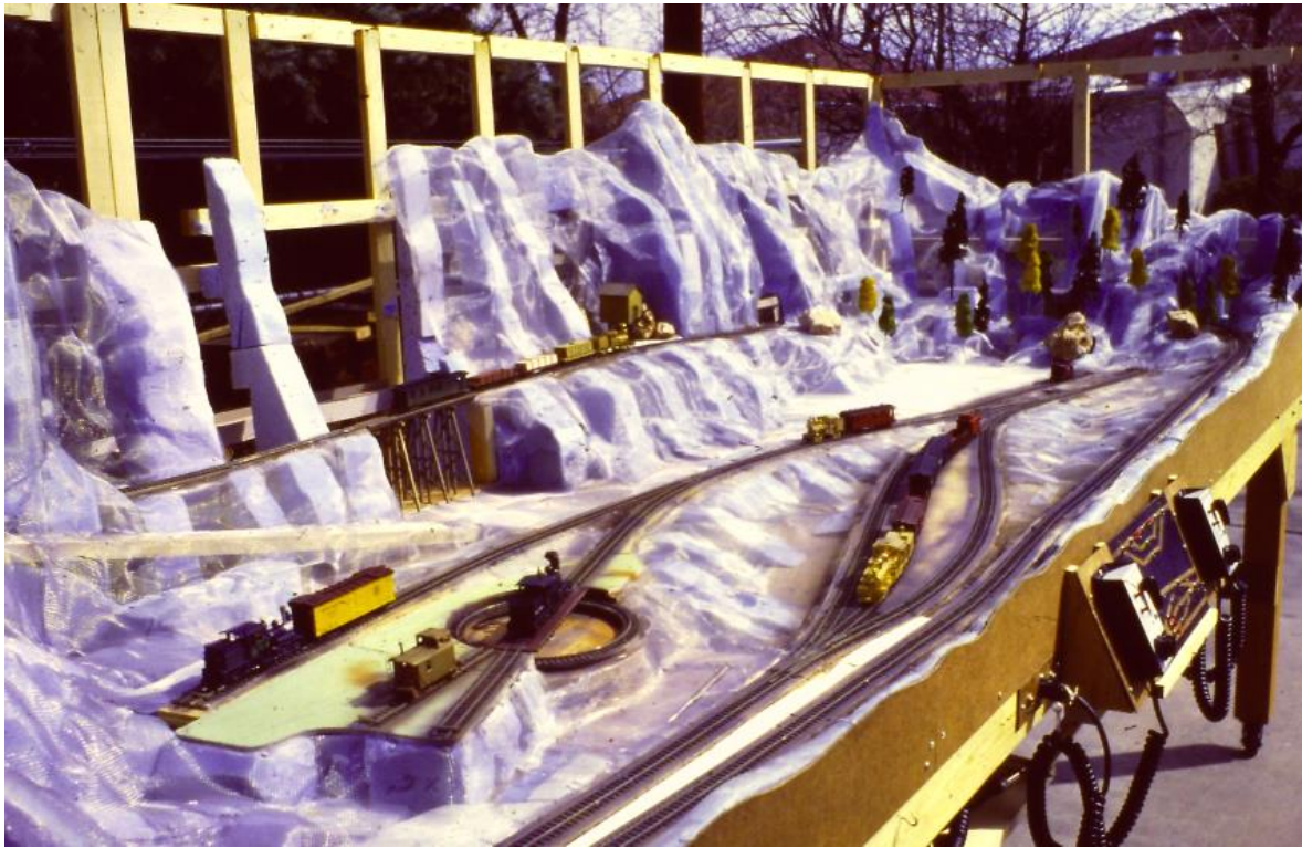
Old family HOn3 layout in building phase.

This is a new section for the Monthly Herald. The photos can be of models working on, layout, train photos etc. Include a little detail about it. You can email me at caspienkronos@yahoo.com .