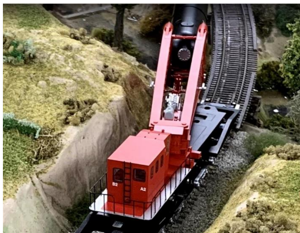
It's not coming through.