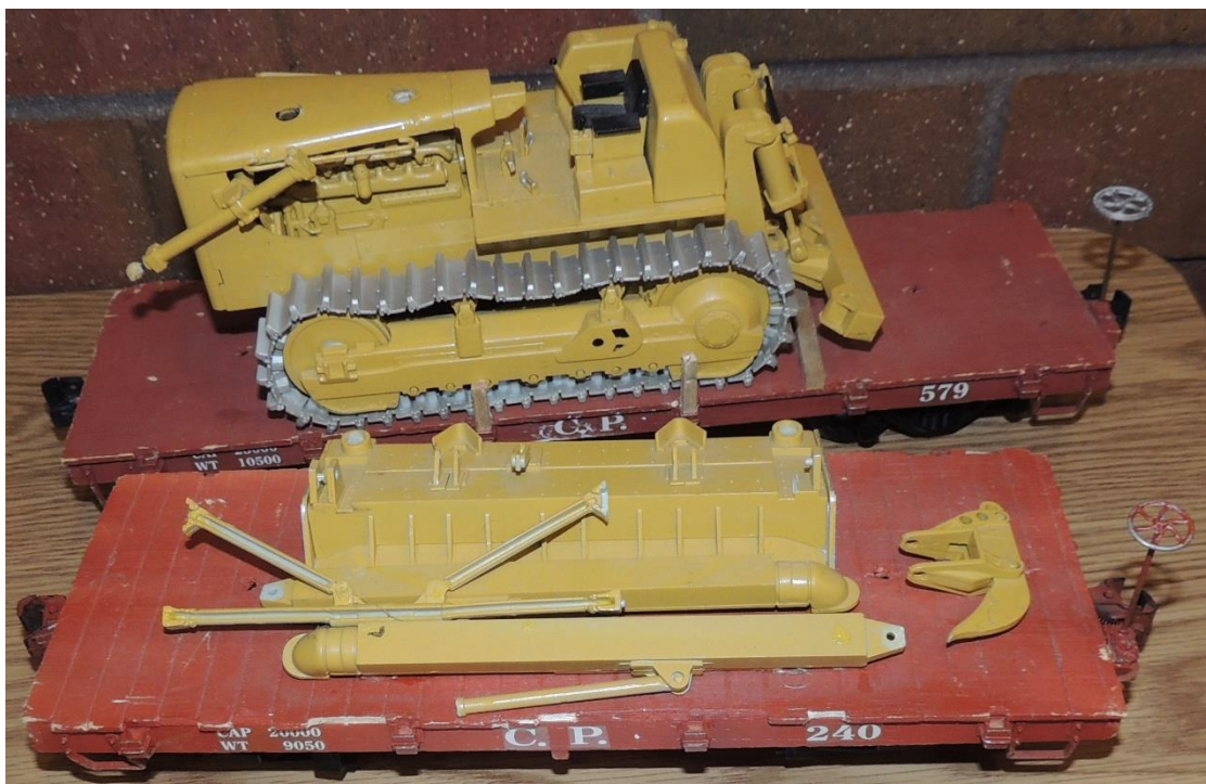
Devin Jones: G Scale scratch built cars with AMT Dozer kit