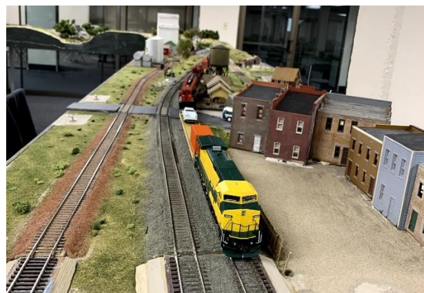
Right side of layout.