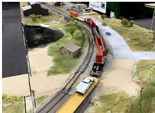
No traffic on the inside track, I hope.