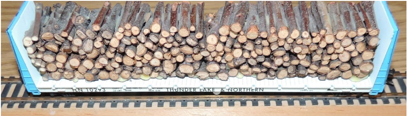
Leigh Swan: The Thunder Lake and Northern with wood from a trimmed bush.