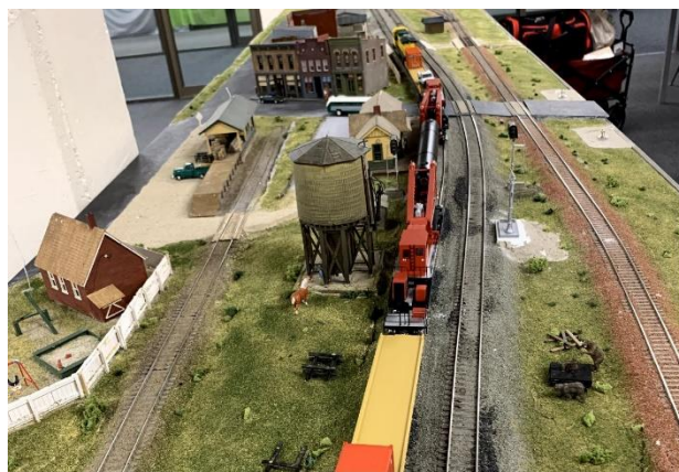
Left side of layout.