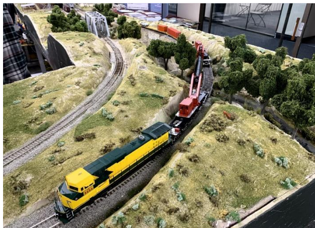
Alright, who planned this route?