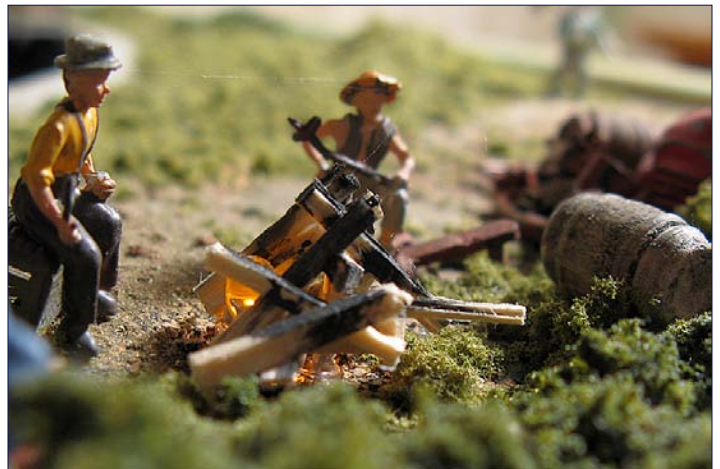
While the Grounds Foreman was away for college this summer, some hobos moved in outside the yard near the junk piles. The Evans Designs "Flickerig Fire" works great by poking through three LEDs from a hole under a wood pile.

The next idea I had was kicking around for some time. I decided to purchase some Evans Design flasher LEDs, which were available at Caboose Hobbies. I bought the flickering fire and red flasher kits. I drilled a hole through the layout in a corner by the "junk yard" and pushed through the 3 LEDs that make the flickering fire. I took some scrap lumber, cut into various widths and lengths, and glued them together in a teepee shaped heap. When that had almost dried, I placed it over the LEDs to get a decent form fit. I then used a charcoal acrylic to paint most of the wood in the middle of the pile, leaving many "unburnt" areas. The red flasher unit was installed in the top of the yard tower, with most of the effort threading the wires through the tube in the middle of the tower which already housed wires for the interior light. Both LED units by Evans Designs advertised a 7-19v DC source, so I hooked them up in parallel with one 9.6v battery. This worked pretty well, since I found them still working great a day after I forgot to turn them off.