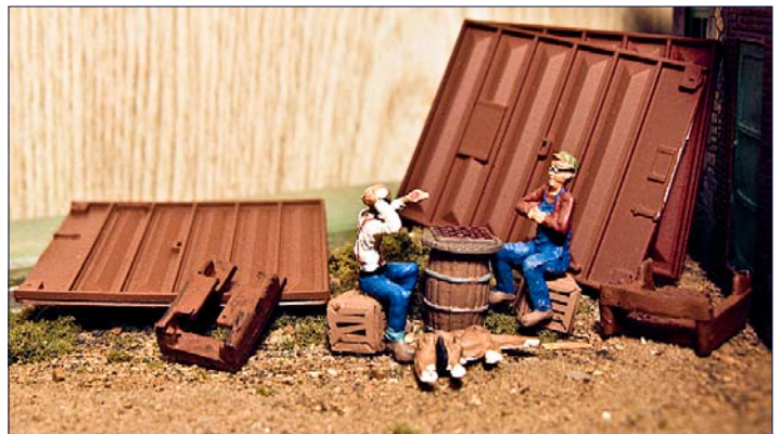
Figurines draw attention to an area. Use some extra parts leftover from kits to add interest around buildings.

A search through the extra parts bins found some already rust-painted plastic wheel sets, truck frames, couplers, extra box car doors, and other small parts. These were placed to create junk piles around the shop building and grounds near the turntable, unfortunately attracting all kinds of nefarious characters. —SH