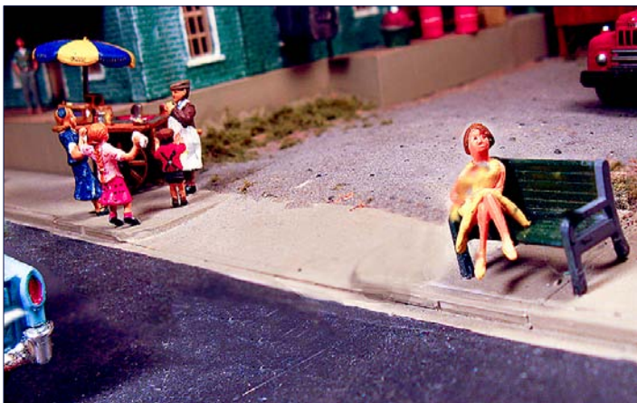
Woodland Scenics wiener stand turns an empty sidewalk into an interesting vignette. Don't forget the innocent bystanders standing or sitting nearby.

An empty public transportation bench was moved to accommodate the wiener stand after a sitting passenger-to-be was added, who was dutifully cleaned up with a #11 Xacto® blade and carefully repainted.