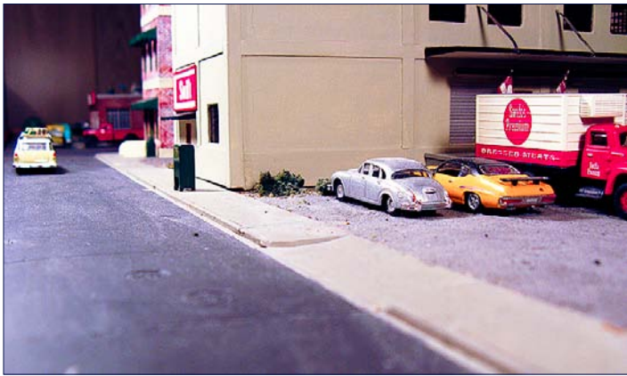
This scene along the front of the layout seemed to be beckoning for some activity on a typical summer day

After some inspiration from the layout tours at the mini-meet, I took another look at our Time-Saver switching layout and noticed it was time to add some more details. Besides the lack of trees, signals, and telephone poles, there was a noticeably severe shortage of people. I decided it was time to add those Woodland Scenic people I picked up in Michigan this summer...and maybe a few more.