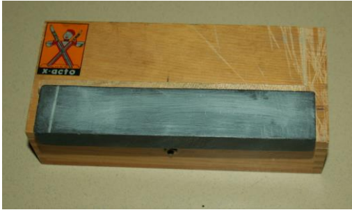
A sharpening stone