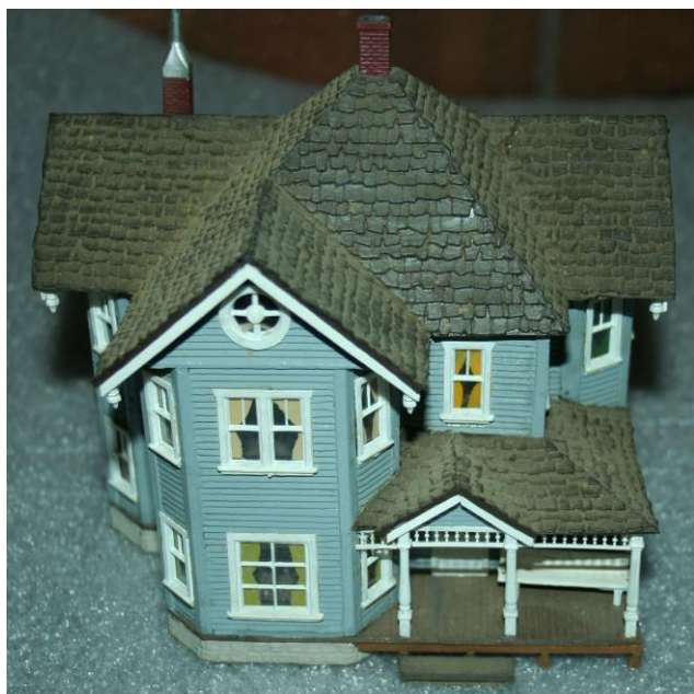
Dick Hunter brought in this elegant Victorian home that looks like it might have built around the turn of the century.