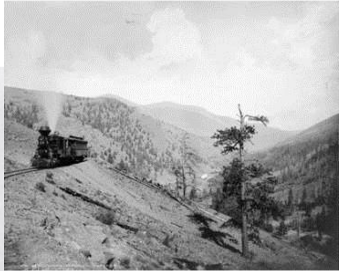
east side of Kenosha Hill with Webster below in the background.

The line descended Kenosha Pass into Jefferson and Como in South Park. At Como the line divided with one segment traversing Boreas Pass, descending into Breckenridge, Dillon and Frisco, then ascending Fremont Pass and on to Leadville. A segment of this line is still in operation from near Fremont Pass to Leadville, now operated as a standard-gauge tourist line.