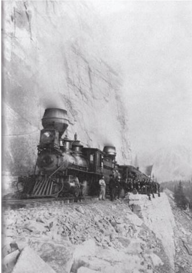
This picture taken at Palisades a short distance from the west entrance of the Alpine Tunnel

River and up to Kenosha Pass. Many of the original stone bridge abutments are still visible along the river.