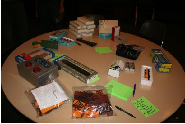
This was the complete set of auction items

The following is a list of auctioned items and buyers: