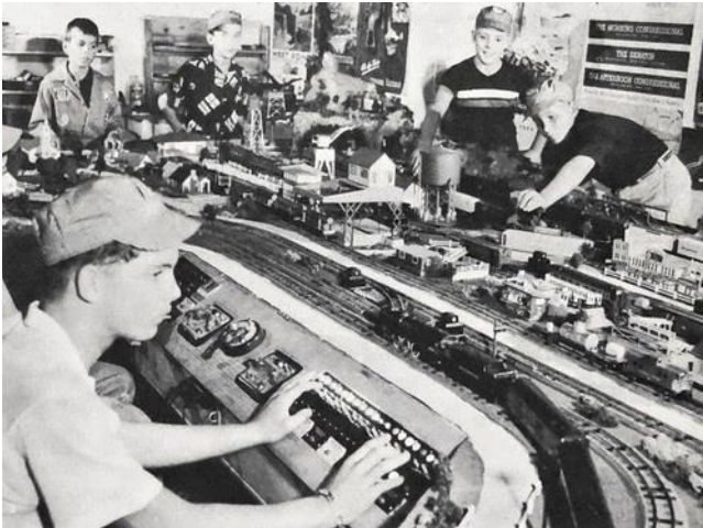
Waybill April - May '21 7

The show seen in the following illustration aired in October, November and December of 1950. It was repeated during that same time period for the next two years.