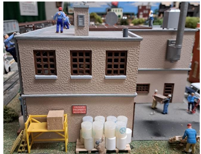
Note the supply of barrels (desiccants) from various pill bottles. I haven't gotten around to painting all of them yet. The inspiration for this building came from a package of machinery that I purchased for $25.00. Outside of glue and a piece of styrene for the roof, the first and second floors and walls, this was another frugally built structure., utilizing other pieces of “stuff” laying around.