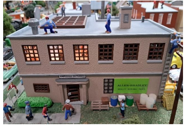
Sidelight: I worked at the Allen-Bradley Company for over 35 years