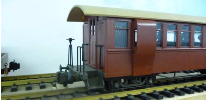
The "Look-Out" sub-assembly being tried in a few optional locations along the coach side.

Trial fit checks completed, all the components are removed, painted, then glued into final place.