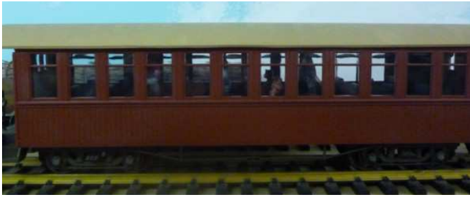
The plain B Class coach prior to modification.

An adaption of a CLV Van using a Bachmann coach with several window INFILLS & Guards Lookout.