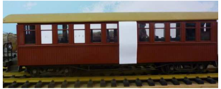
Modifications trial fitted.

Trial fit checks completed, all the components are removed, painted, then glued into final place.