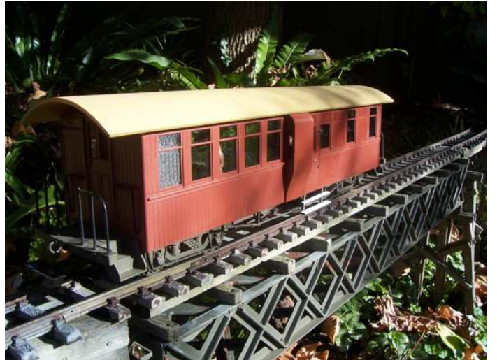
These models are fore-shortened versions that hopefully capture the look of a CLV.