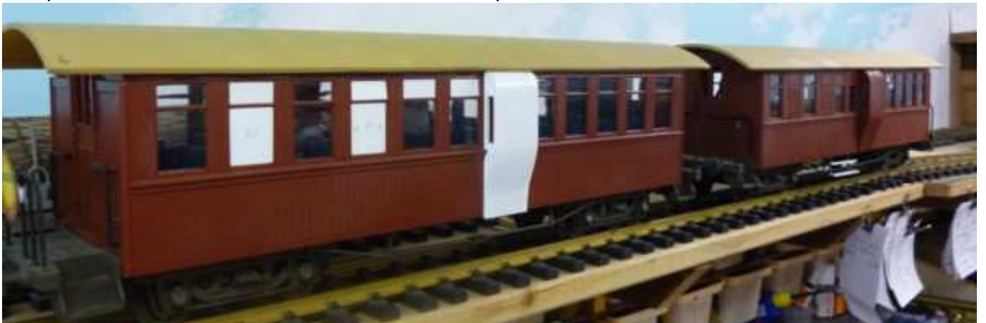
All new parts were painted before they were fitted into final locations.

Two plain B Class coaches have been modified this way.