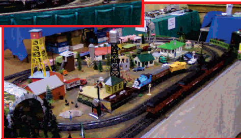
Above-Will's Layout and the LAP display Below-Dave Wilma's Layout