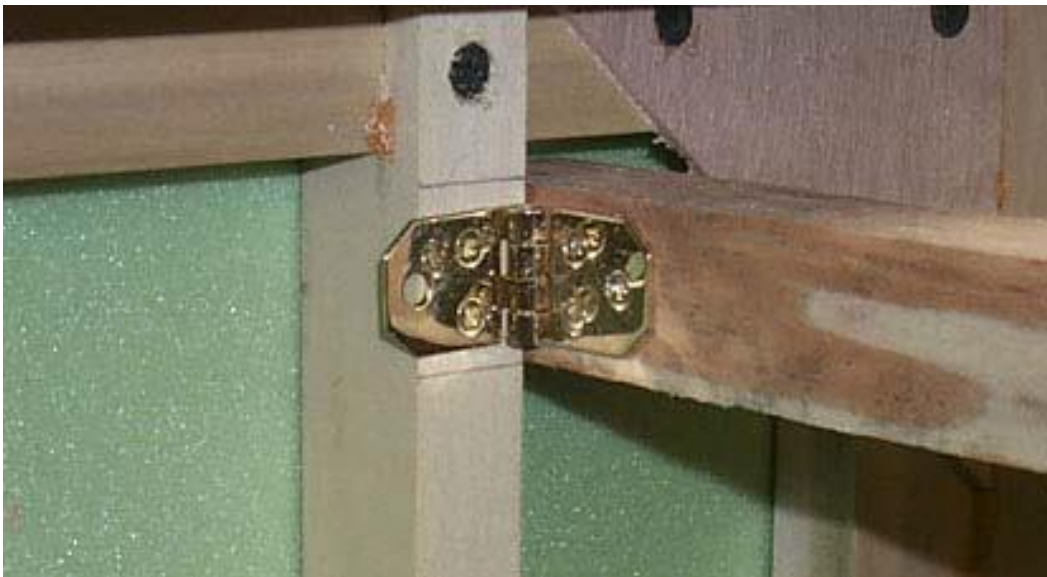
A close up view of the hinge used to attach leg pairs.