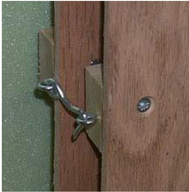
A simple hook latch secures the legs so they won't come flying out when transported.