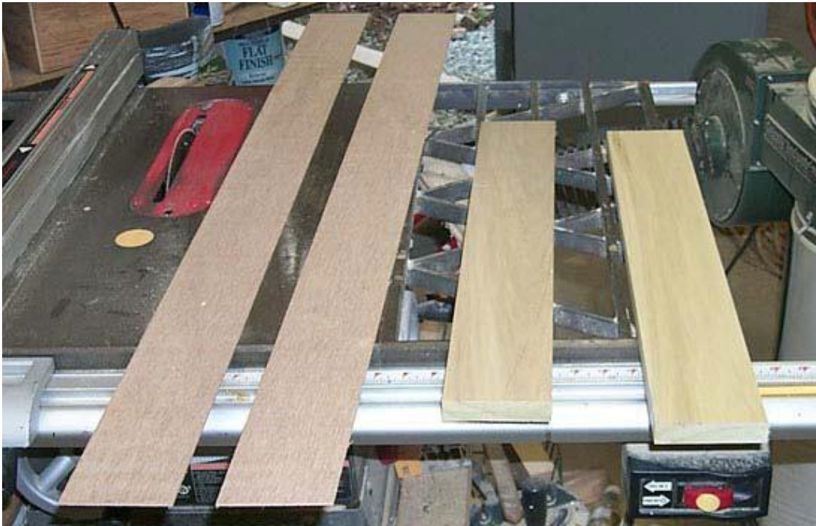
Lightweight sides are cut from 1/8" luan plywood and ends are cut from 1 X 4 Poplar.

For this clinic I have chosen as an example the foam top with gusset type of module.