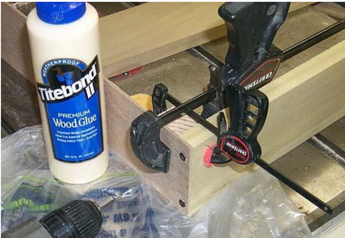
Sides overlap the ends and are joined with glue and screws. Clamps and a temporary block aid assembly.