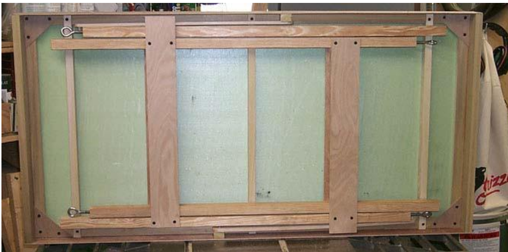
The second pair of legs is attached. Note that this set of legs has extended braces, mounted on the front side of the legs, so that the captive diagonal braces will be secured when the legs are folded.