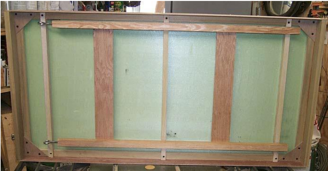
The first pair of legs is attached using hinges. Note that the braces are on the back side of the 5/4" legs.