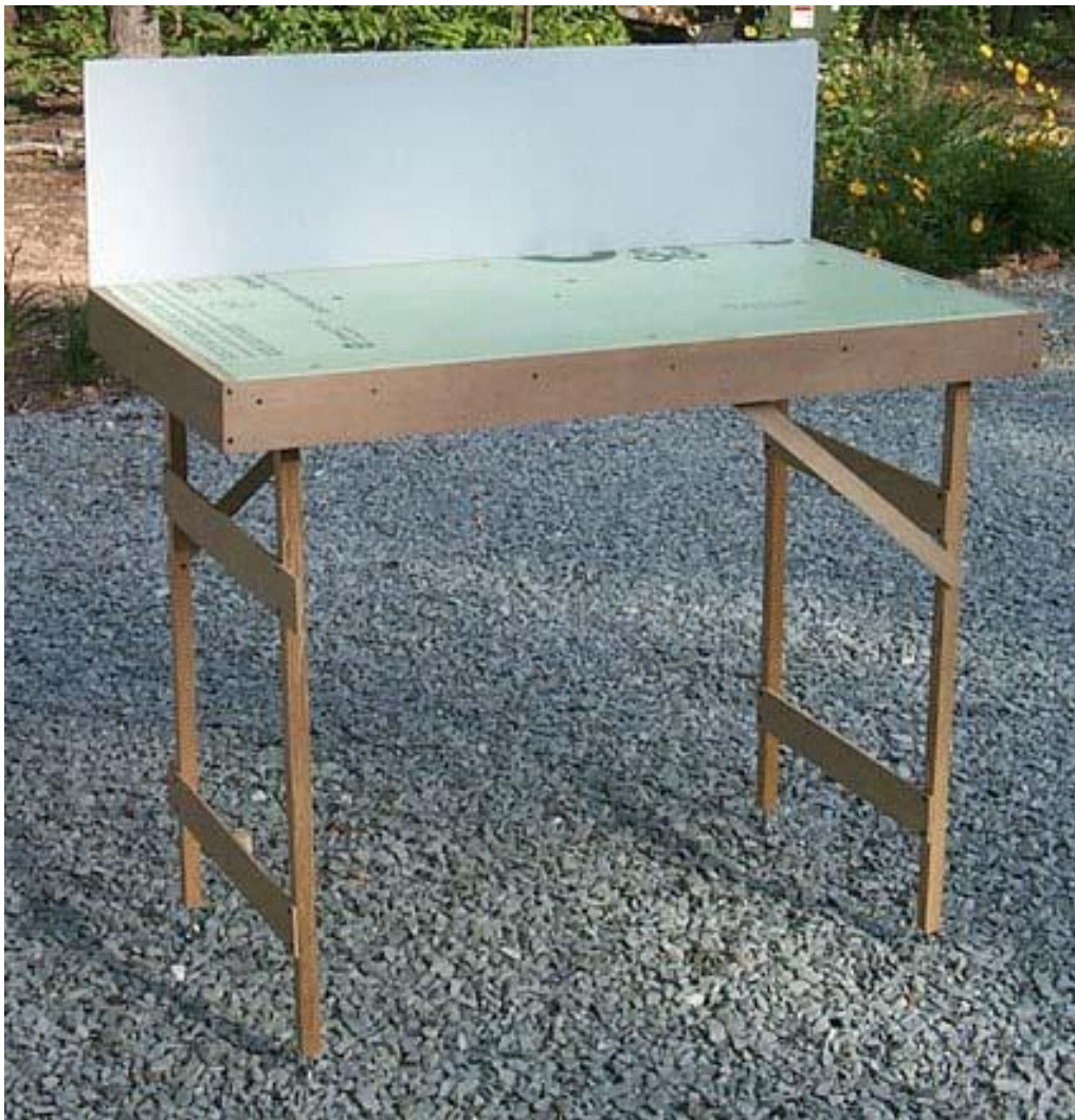
And here is the final view of the completed module frame erected and ready for track and scenery.