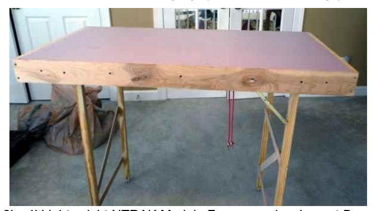
2' x 4' Lightweight NTRAK Module Frame used as Layout Base

1. A complete light-weight NTRAK 2' x 4' frame with folding legs (David Thompson design), with my own added touches.