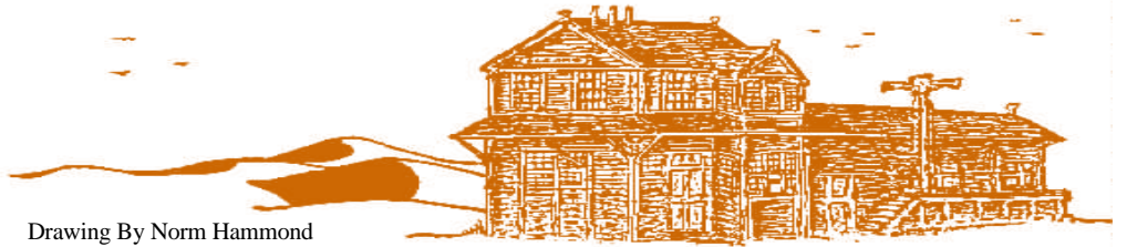
Drawing By Norm Hammond