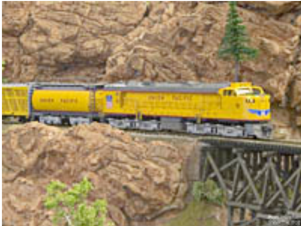
A Union Pacific freight takes the mountain route

Each of the 4 track systems may be selected for DC or DCC power. You can run a vintage DC engine on one track while running a modern sound decoder equipped DCC engine on another track. The DC and DCC systems both utilize wireless throttles. The DC system is Crest (Aristocraft), and the DCC system is EasyDCC by CVP.