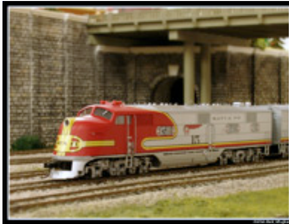
A Santa Fe passenger train under the overpass

Our layout started life back in 1982 as a portable modular layout. Over time it has grown to its present size. It is no longer portable. We have had several homes around Dallas. We moved to our present location in Mesquite in 2001. It is in a warehouse next to the freeway with plenty of well lit parking. The rent and expenses are funded by monthly dues. We keep our membership around 50.