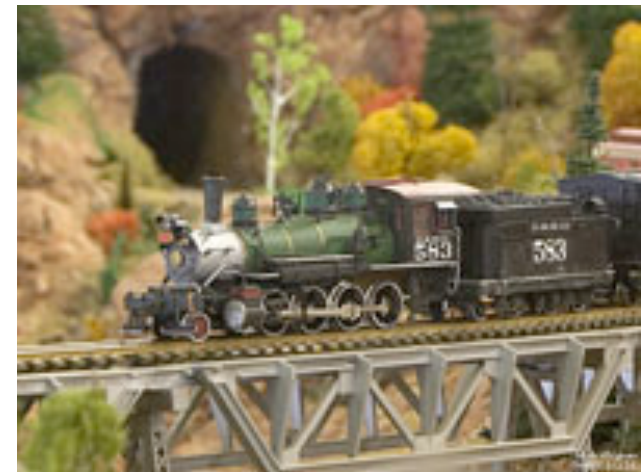
A steam locomotive crosses the mountain bridge

Areas of the layout represent different eras and locations. That allows us to enjoy a variety of scenery, vehicles, and details. There is no restriction on the types of trains that we run. Steam freights and modern double stacks are both at home here.