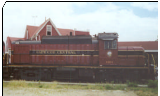
CCCRR's RS-3. Doug Gray.

With thirty miles of track, and thirty crossings, this is a fairly expensive operation. New owners have recently come on board, allowing the acquisition of many new pieces of rolling stock, which are parked near the terminal.