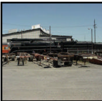
UP's 4449 disguised in black for BNSF's Employee Appreciation Special.

Every vacation entailed at least one train ride. And if a tourist railroad wasn't handy, then a museum would do. And if no museums were on the planned route, then the planned route was inevitably revised. Still, seeing steam in action was a fairly rare event for me. Yes, I saw horrid little logging engines and the requi-