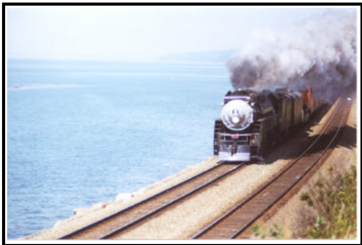
4449 in Edmonds.