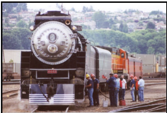
The care and feeding...

first, but quickly went on with their business.