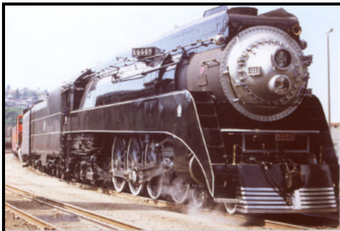
Resplendent in the afternoon sun.