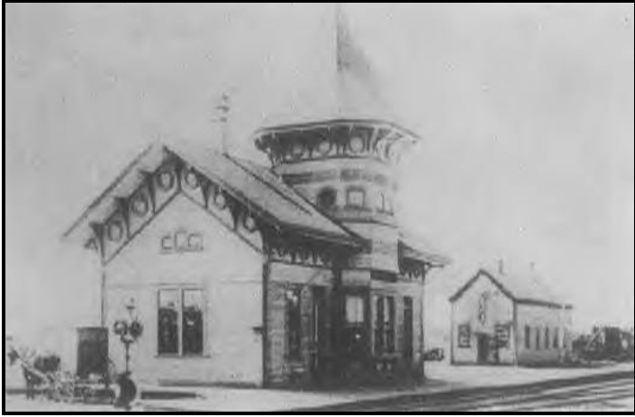
Chatham depot: courtesy of the Jeff Golarz collection and www.caperail.com

air conditioning. Surviving this, I continued on to the Chatham Railroad Museum in Chatham, Massachusetts. The museum itself is a beautifully restored depot on the original site of the Chatham Railroad's